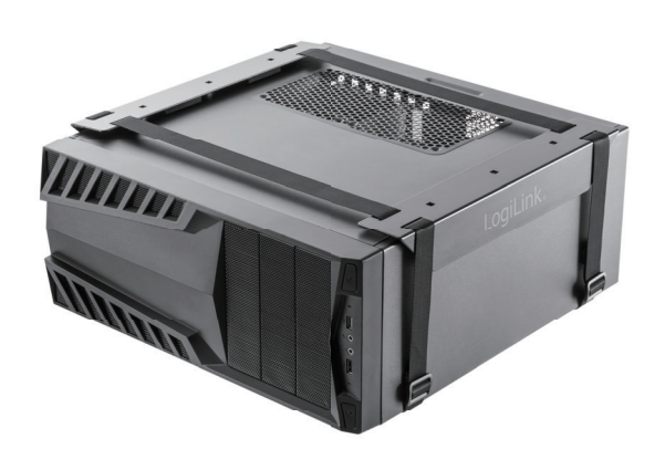
Horizontal Use Is Also Applicable