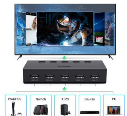
HDMI Switch 5 in 1 out with Remote